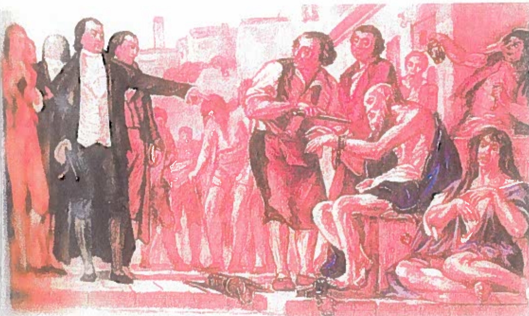
Painting (mid-1800's) by Charles Muller

Humane treatment of people with mental illness gained importance in the late 1700's. This painting shows Philippe Pinel, a French physician of that period, pointing and demanding the removal of chains from inmates of a hospital for people with mental illness in Paris. Through Pinel's efforts, many hospitals introduced more humane treatment programs that included fresh air, exercise, and pleasant surroundings.