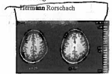
Functional magnetic resonance imaging (fMRI) showing two levels of the brain; areas in orange were more active in healthy controls than in medicated people with schizophrenia.