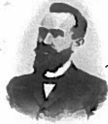
The term schizophrenia was coined by Eugen Bleuler

Eugen Bleuler invented the words schizophrenia and Autism and they got covered up.