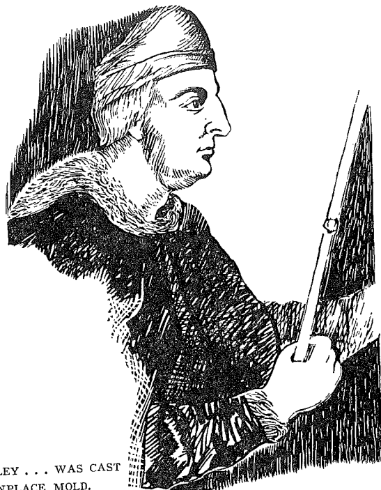
SAMUEL WESLEY . . . WAS CAST IN NO COMMONPLACE MOLD.